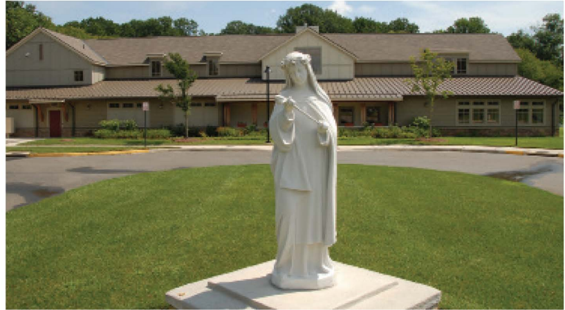
St. Rose of Lima Retirement Villa - Dedicated August 2010