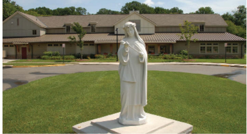
La villa de jubilación sacerdotal Santa Rosa de Lima - Dedicado agosto 2010